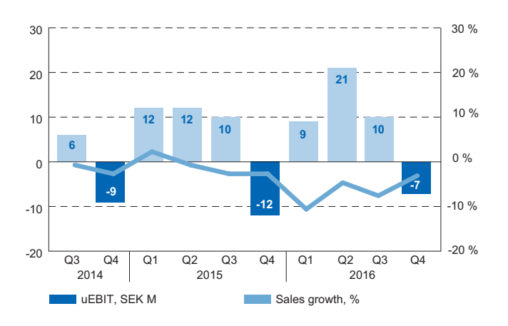
The Group's underlying operating result and sales growth per guarter